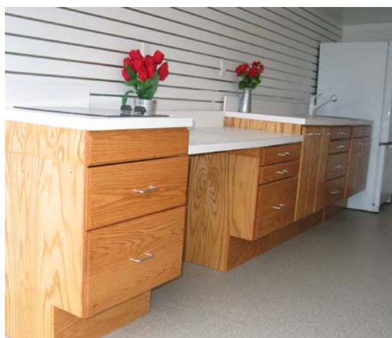
Figure 2: “Accessible” configuration